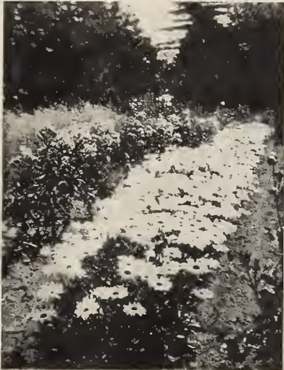
Perennials in a corner of Our Flower Field.